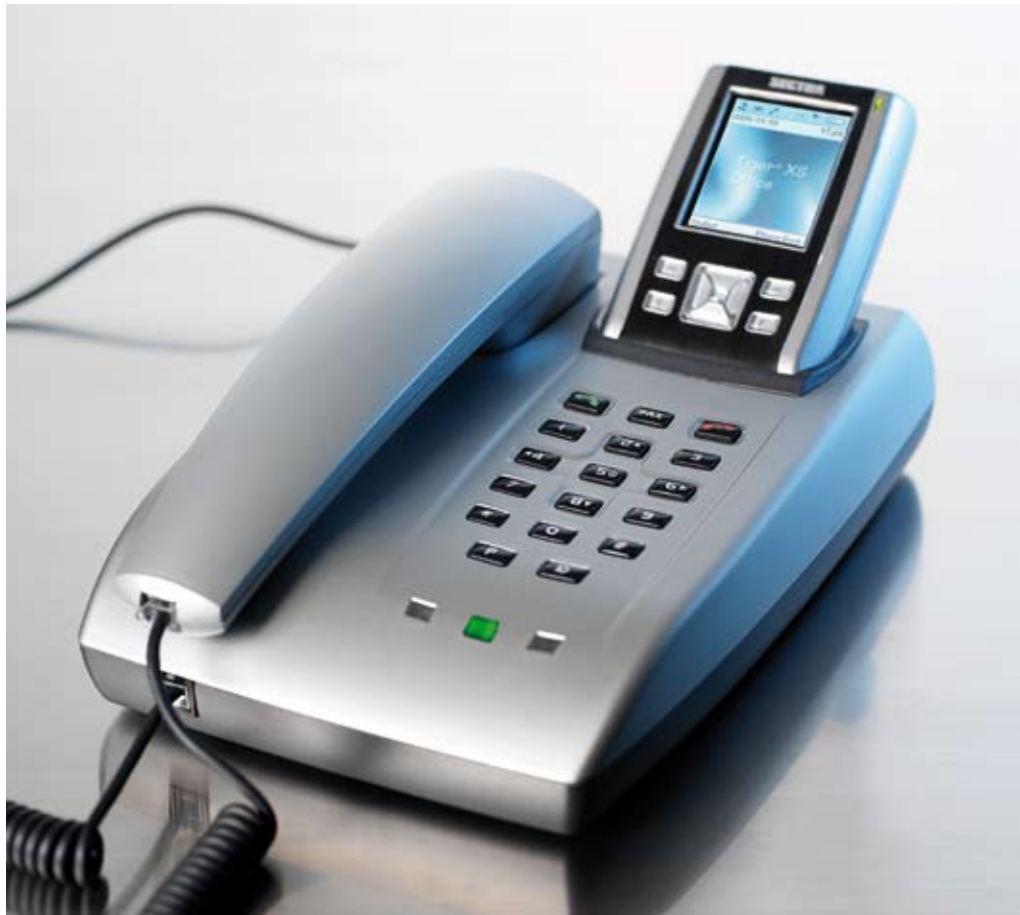
Tiger XS Office extends use by adding a secure desktop telephone with fax functionality to the Tiger product line.

Tiger XS enables secure mobile voice communications and secure messaging (SMS). At the office, you can also use Tiger XS as a secure desktop phone and fax by docking it with the optional desktop cradle unit, the Tiger XS Office. Government officials on the move can easily use Tiger XS for secure file transfer or for remote access to a classified computer network. At Sectra, we are committed to ensuring that you can communicate securely whenever you need, wherever you are.